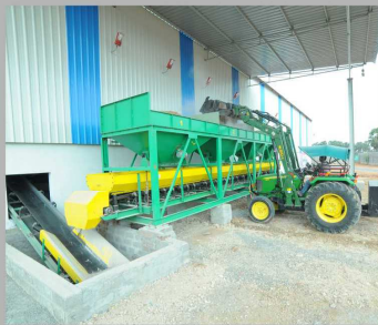
Four Bin Aggregate Batching Plant